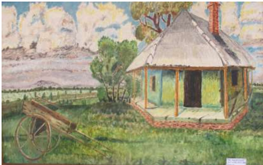
THE ROUND HOUSE Built on Vale Head in 1835 Painting by E Copson