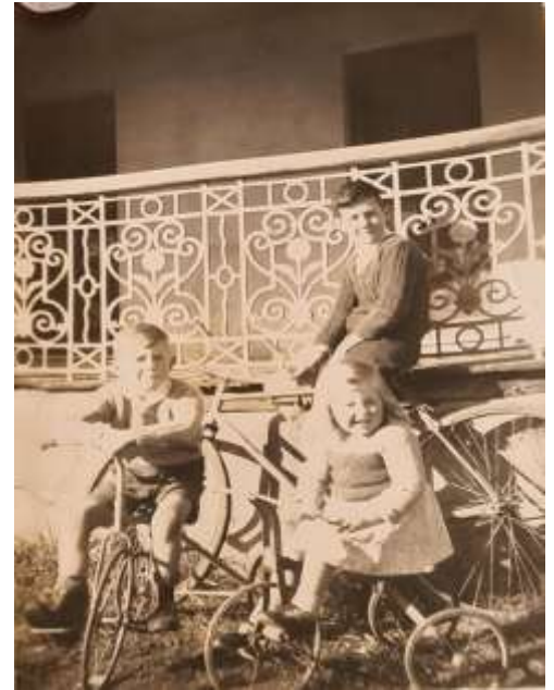
Can you identify these children and where was the photo taken (see page 5)